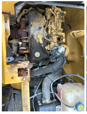
Engine Compartment Photos

Engine Smoke (Upon Start-up, Idle, Shutdown)