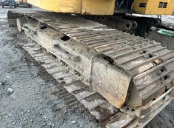
Pad Width Photo