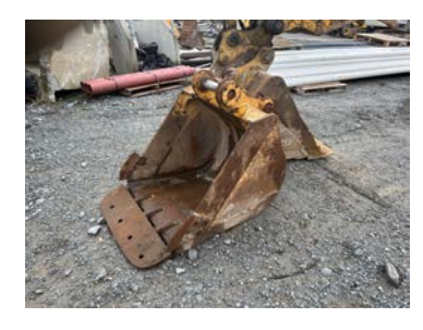
Attachment Serial Number Photo Attachment Width Photo