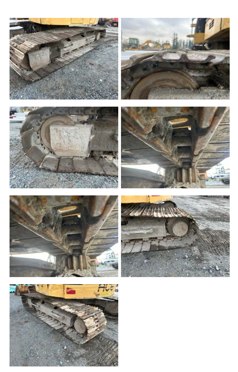
Right Track - Photos

Take photo of tape measure on pad/grousers