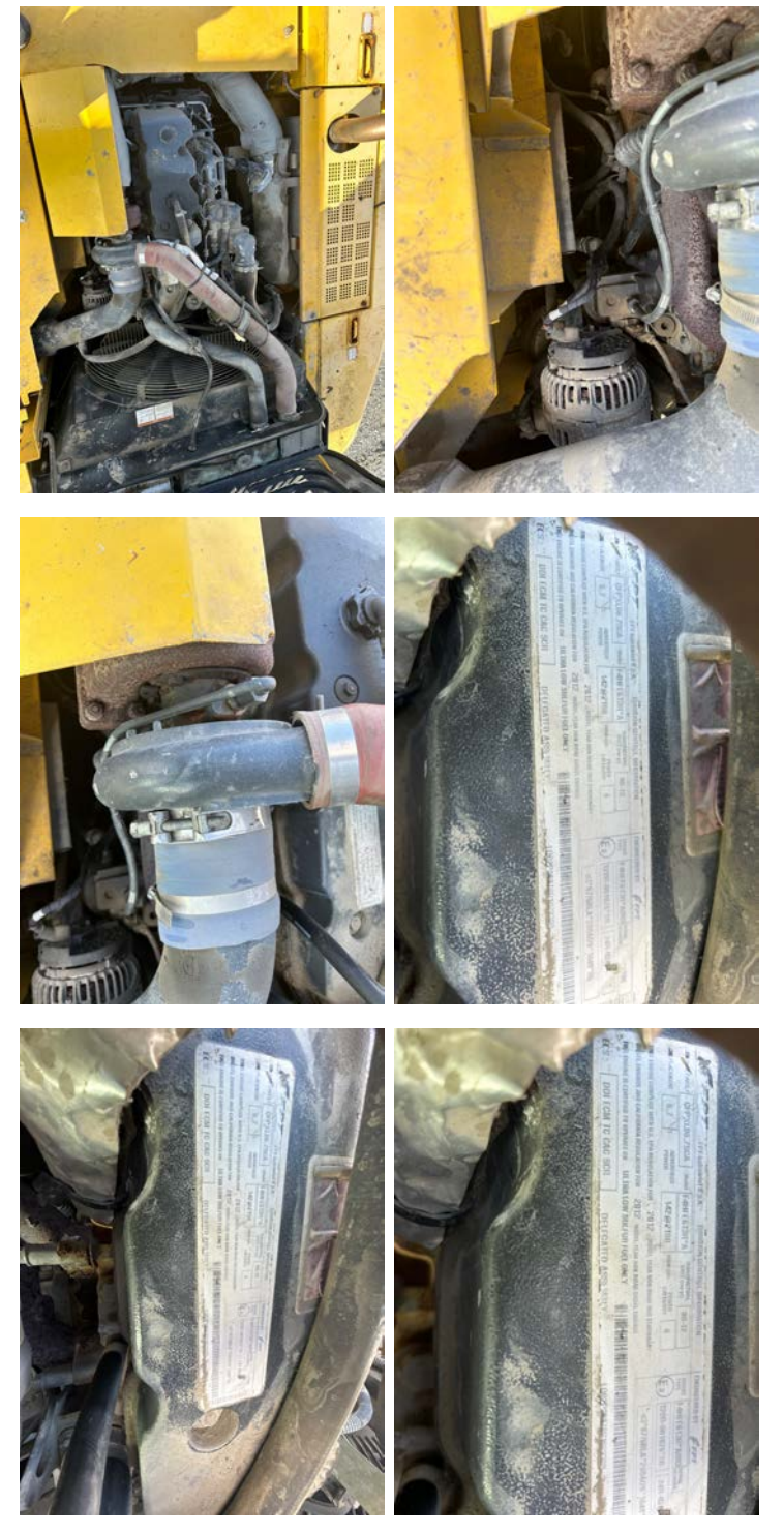
Active Engine Codes A/C Compressor Engine Data Plate

Engine Type (Make, Model, Cylinders, HP) Blow-by (Visual Observation Check) Engine Smoke (Upon Start-up, Idle, Shutdown)