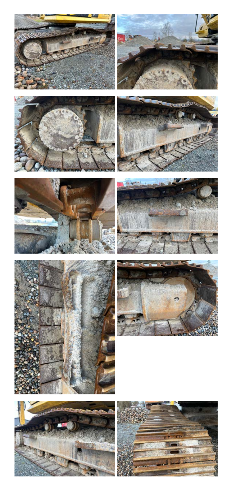
Right Track - Photos

Take photo of tape measure on pad/grousers