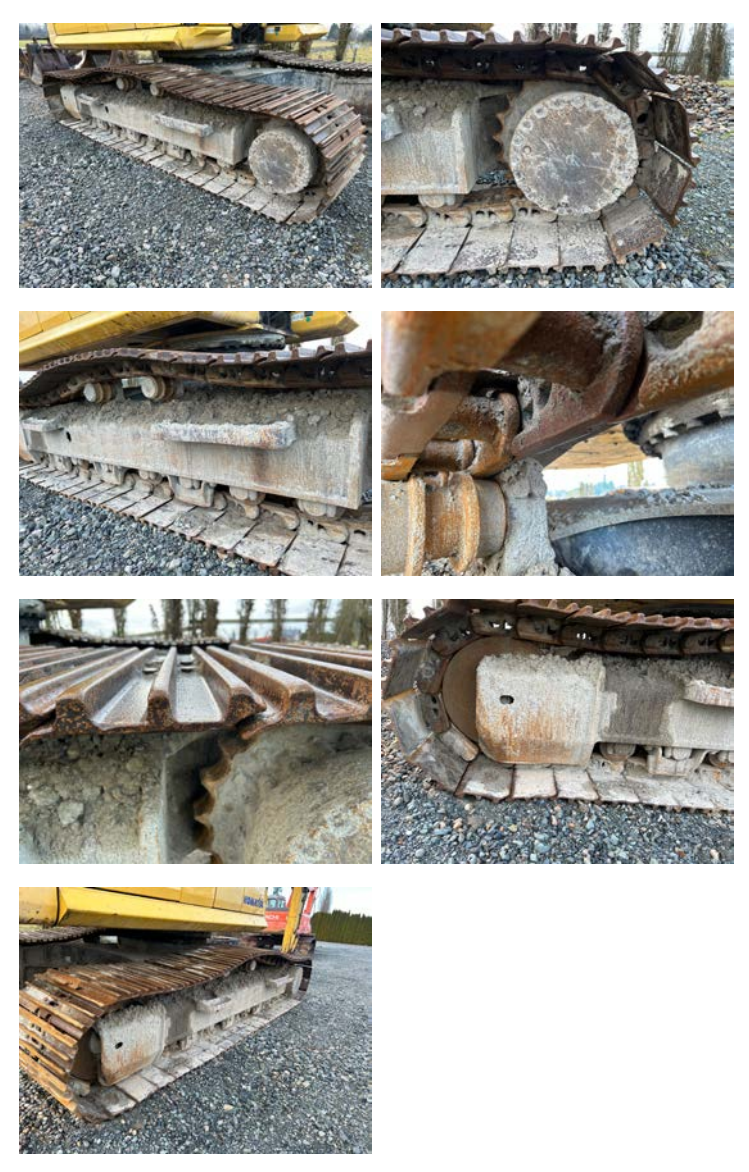
Pad Width Photo