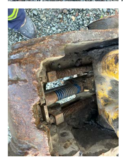
Hard Bar Photos