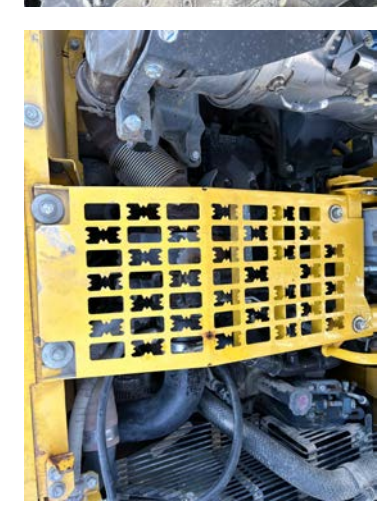
Active Engine Codes A/C Compressor