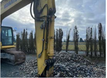
Hydraulic System Photos