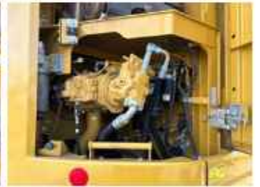
Hydraulic Leaks Photos